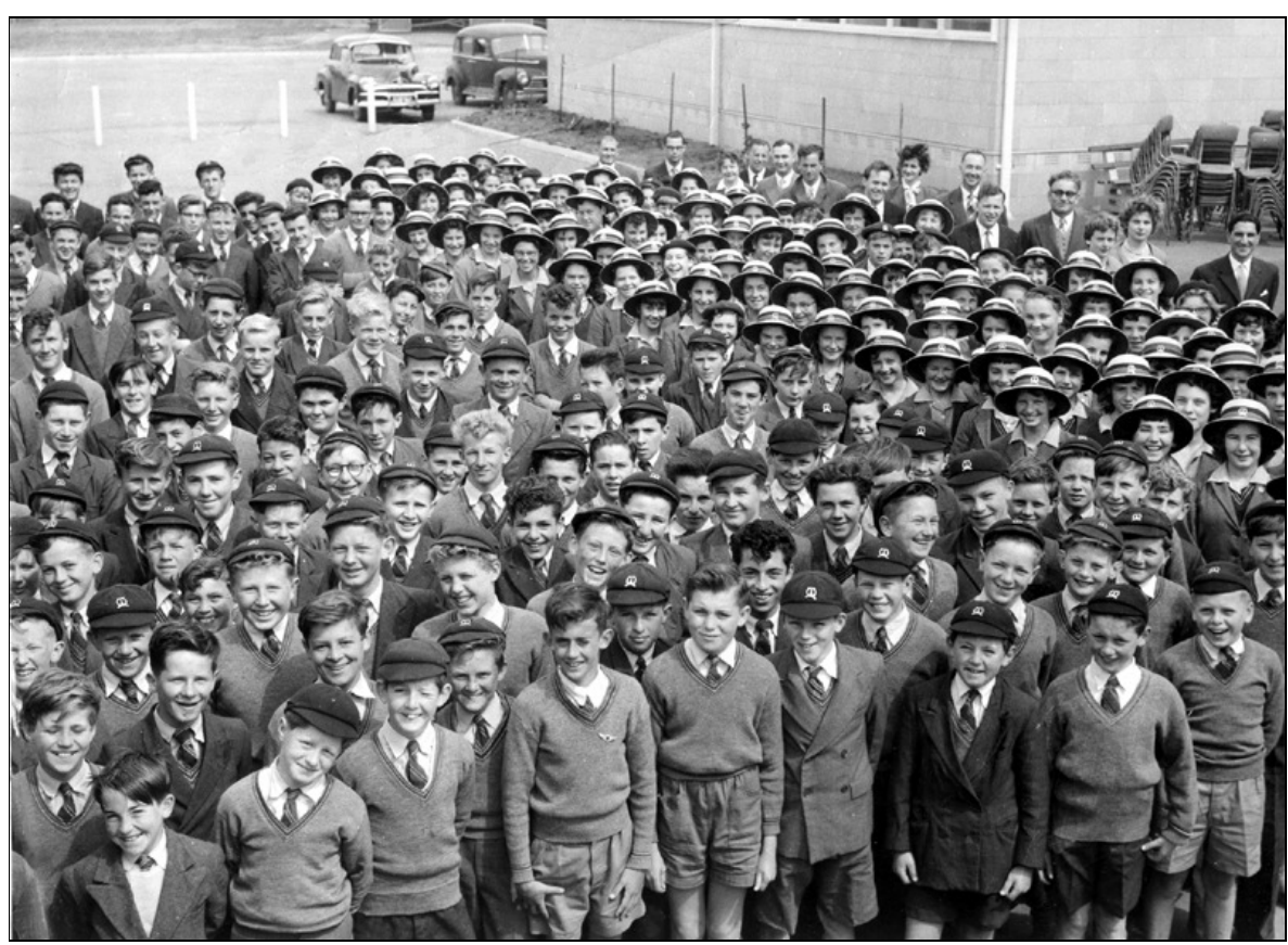
School assembly at St Albans, 1958.

still doing things for the first time - whether it is taking part in inter-school athletics or gaining Proficiency Certificates or planting a tree.